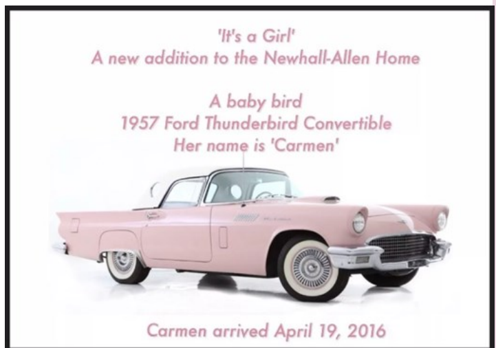
She announced her buy of the car with this announcement

She has had Carmen featured for Bride and Groom wedding pictures and in several movies and TV shows. Her last day on the job featured Carmen in NCIS LA!