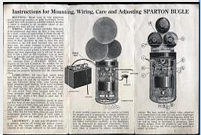
The Original Owners Manual: The Sparton Bugle Instructions and Service Reference