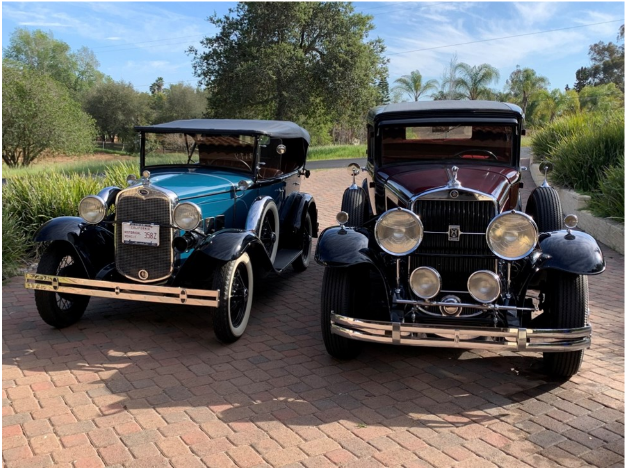
My 1930 Ford Model A Phaeton and my 1930 Cadillac 353 Town Sedan