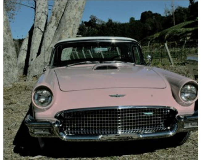
Monserate Winery Mini Car Show