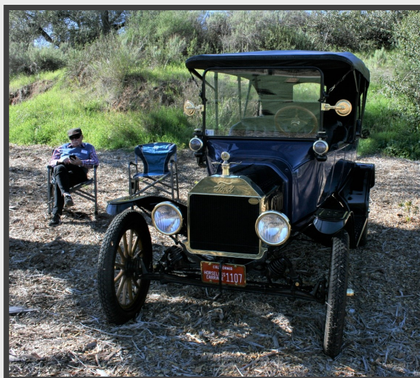
Mike with his “T” at Monserate Winery Mini Show

Once cleaned up though the car was in pretty good shape. The engine is a 4 cyl., 176 Cu in.; 3-3/4” bore x 4” stroke. It features a planetary transmission, 2 speed, operated by pressing on foot pedals. This was the predecessor to the automatic transmission.