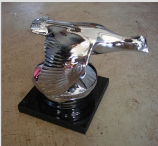
1928-31 Model A