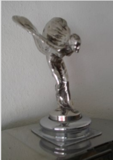
Late 1960's Rolls-Royce

The British, in particular, embraced automobile mascots as a form of free expression, from the seriously artistic to the silly and down-right rude. Hundreds of different mascots were available in the British aftermarket. One could choose from: half-clothed nymphs, a mythical sphinx, the Roman god Vulcan, and various animals, airplanes, whimsical characters--and countless forms of stylized women. Most hood ornaments/mascots were made of either pot metal or bronze, and were nickel or chrome plated.