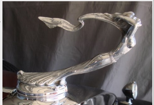
1930 Cadillac Goddess