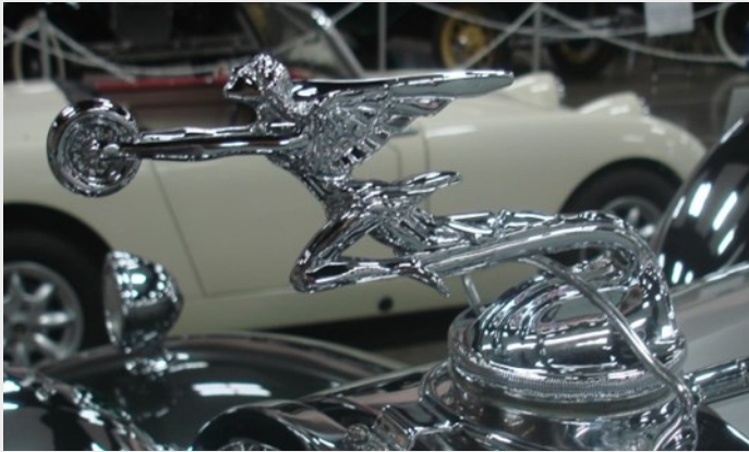
1931 Packard Deluxe Emblem or Goddess of Speed

There is nothing quite like the hood ornaments of the past. From the late 1920s and into the 1950s, most automobiles sold in America were offered with one or more hood ornaments as options. These artful little additions to radiator caps, and later the front-center of the hood, announced the character of car and its manufacturer. And if one was dissatisfied with the factory ornament, there were a wide variety of aftermarket hood ornament available.