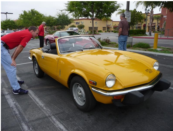
1976 Triumph Spitfire 1500, overdrive. Bought new by seller. Repainted and reupholstered once. Good condition.