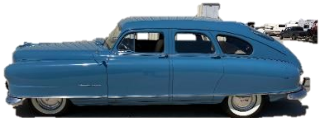
1950 Nash Ambassador Super. Hydra-matic. Seats fold into bed with mattress, window screens Good condition

All three cars are advertised in Hemmings.com