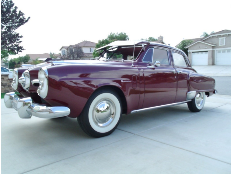
1950 Studebaker Commander Regal Deluxe with automatic transmission Restored inside and out and engine overhauled. Excellent condition.