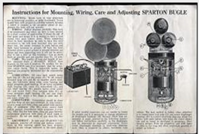
The Original Owners Manual: The Sparton Bugle Instructions and Service Reference

A Region of the Antique Automobile Club Of America