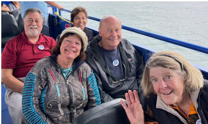
Fun on the Bay riding the amphibious Seal