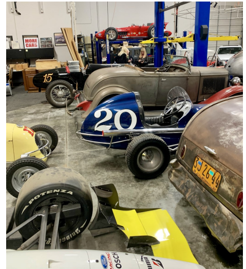
Tom Malloy Foundation Car Museum

Speaking of Car Shows, our 56 th Annual Car Show is coming up fast. Our