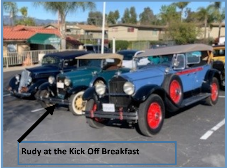
Rudy at the Kick Off Breakfast

Lots of tinkering has occurred on the car. Seat belts (my request), new distributor installed with Glen Wior's assist, LED headlights, new tires, new trunk to match the top, alternator, brake adjust, new gauges...soon a Mitchell transmission and overdrive.