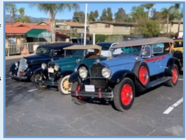
Maiden Voyage of Jim's 1929 Packard Phaeton

Shortly after this we decided to move to Colorado. There I started the restoration. The first task was to make all new body wood as the termites in Hawaii had made Swiss cheese of the original wood. I rebuilt the engine, media blasted the frame and all of its components and painted everything. I picked a French blue for the body with black fenders, red wire wheels and body molding and painted it myself. I had the upholstery redone in black leather to original patterns and the top in a tan material. I have the original side curtains in good shape as the car does not have roll-up windows.