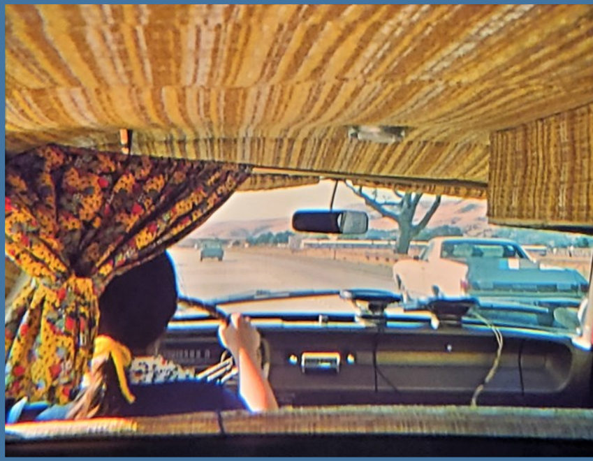
Sharon driving our Mini-Camper Ford Falcon Station Wagon on our honeymoon

I outfitted our 65 Falcon Station Wagon as a camper, removing the back seat and making a hinged platform with storage underneath, adding a shelf the full length of the back of the station wagon with a swing up door, using the area under the spare tire cover as clothes storage, and adding a crank operated screened vent on the back top for use while camping. We also added a cassette stereo system on the shelf at the back of the wagon.