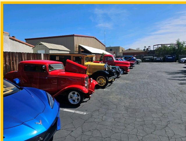
Bucket T T, Bucket T Bucket T Wow!