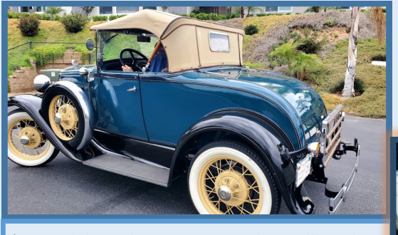
'31 Model A Deluxe Roaster Back in Fallbrook

and visit his friends. He was unable to continue his car restoration hobby and returned to building his world class model airplanes. My dad passed away in 2000 after being confined in a wheelchair for 17 years.