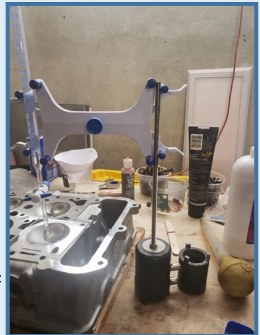
Checking the combustion chamber volumes:

My wife and I moved to Fallbrook (actually, De Luz Heights) last December after having lived on a 50-foot powerboat in Marina del Rey for about 6 years. I work for an organization in Santa Monica and only need to go into the office once a week. This allowed us to broaden our horizon and we really wanted to live more in nature, something that is not impossible around Los Angeles, but unaffordable for us. We ended up finding a very nice home on 8 acres in De Luz and have been thoroughly enjoying living here since December. Not unimportantly, the house has a 3-car garage and I've already collected three more restoration projects: a 1961 Alfa Romeo, a 1964 FIAT convertible with a rare 4-cylinder Maserati engine, and a 1968 Ford Mustang with a 302 V8. We also daily drive a 1990 Ford Bronco II that my wife, who is a painter, turned into an 'art car' that you may see around town (after I replace the master brake cylinder and sort out a mysterious ignition fault that has eluded the professionals so far) from time to time.