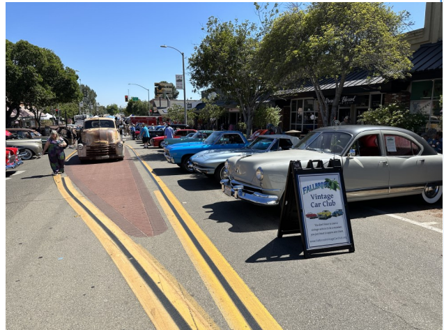
2023 Summer Nights

Summer Nights are BACK!! Stay Tuned for more details to come but mark your calendars for these dates! July 27 th and August 10 th downtown Fallbrook.