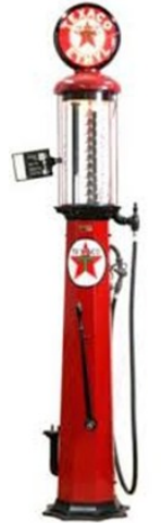
American Oil Visible Handcrank Gas Pump Approx 1930

clock. Some clock-face pumps were electric powered, so they were faster and easier to use. To reassure customers that the pumps were actually pumping gas, there was a small glass window, known as a “sight glass”, showing gasoline actually flowing with a spinning device.