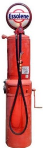
Gilbarco Previsible Curb-side Handcrank Pump Approx 1920

During the teens and up to the early 1920s, a larger “pre-visible” type of gas pump (left) became popular. These hand-cranked, curb-side gas pumps efficiently dispensed gasoline directly into the customer’s car. The problem was that customers started to suspect that gas stations were stealing from them by under delivering. In response to this customer suspicion, gas pump manufacturers started selling so-called “visible” gas pumps.