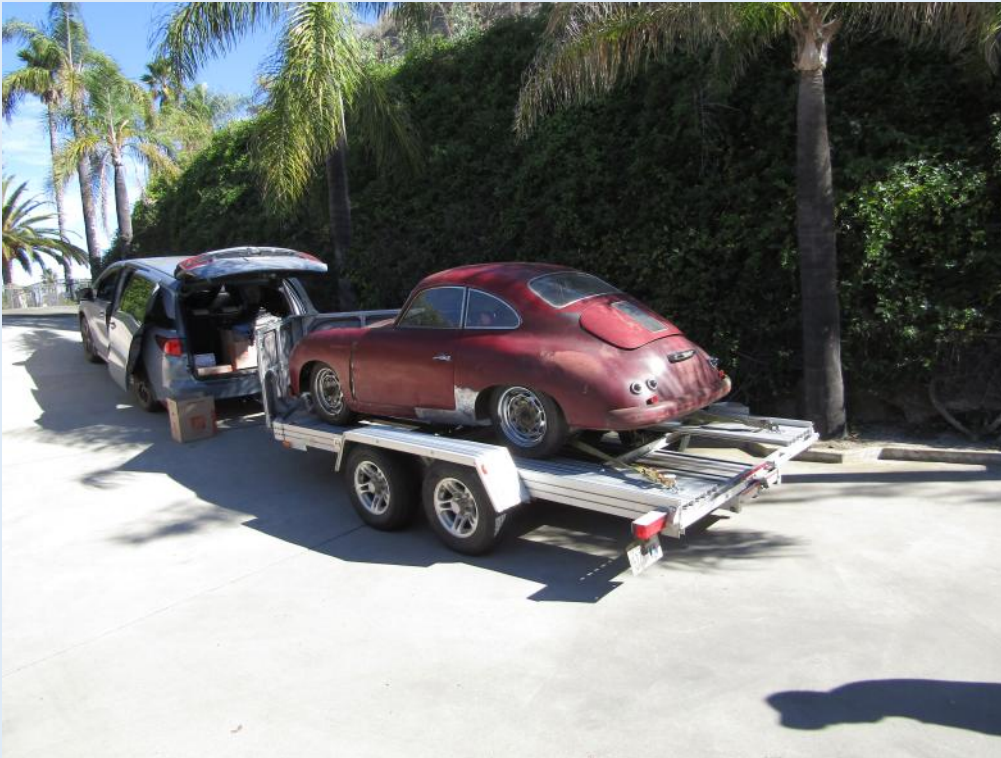
The 1955 Continental Coupe

My introduction to Porsche was in 1955. I was living in Hawaii and had a paper route. A new customer moved into my neighborhood and I began delivering papers to them. They had a brand new 1955 Porsche Continental coupe in Turkish Red. I carpooled to school with their children for a few years and then I lost track of them.