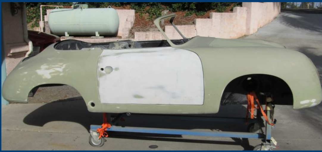
The 1954 Cabriolet Body waiting for a new "coat"

After I retired, we moved from Hawaii to Colorado and then to Fallbrook (my wife found out she didn't like snow). This is a kind of convoluted way of getting to my current Porsche. A friend wanted to buy the 55 and kept after me for years. It had sat unrestored while I restored my 1929 Packard. A year ago he finally made an offer to trade a 1954 Porsche Cabriolet plus cash for my 55 and I made the trade. I had owned a 1955 Porsche Cabriolet before and wanted to get back into an open Porsche.