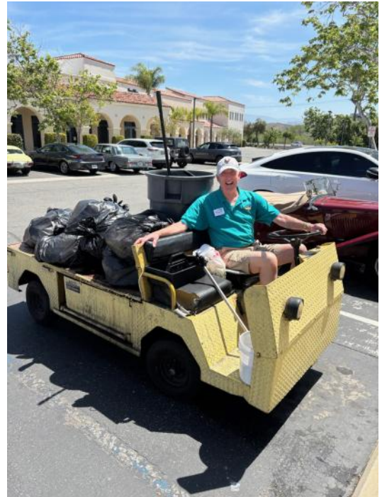
Dana talkin’ Trash!

Juliet’s met May 23 at Village Roots, but we never think to take a picture as we are too busy talking!!! Fun Lunch!