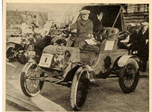
Oldest and Fastest

In 1931, as the nation was falling deeper into the Great Depression, and new car sales were declining dramatically, the organizers of the annual Philadelphia Automobile Show of new cars decided to invite some local owners of antique cars. The plan was to stage an event named the “First Antique Automobile Derby”, a loosely competitive tour of early automobiles to the new car show location (photo above). The old cars needed to be at least 25 years old (1906 or older) and had to be driven 25 miles to the new car show. The car show organizers and new car dealers offered some trophies and cash prizes to the antique car owners for successful participation in the Derby.